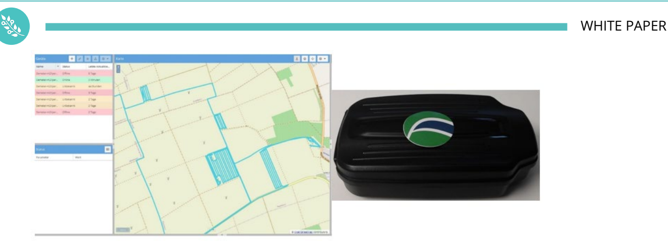
Figure 1 GPS hardware mounted on the several tractors for job identification and documentation.

Job Cost Calculation provides a geospatial cost map per hectare which refers to the cost of chemical product applied on the field, see Figure 2. The cost map can eventually be integrated with fuel consumption information as well as machine and equipment depreciation costs to reflect more granular cost information. Fixed cost such as insurance and labour costs also can be integrated and is mostly provided by the farmer during data entry.