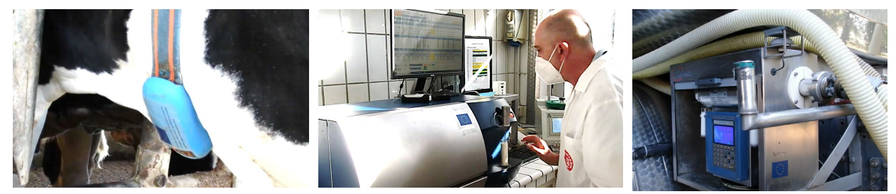
Figure 1: Pilot 4.2 - Some hardware components used in the pilot

The Pilot is deployed in the premises of Maccarese Spa and of Latte Sano Spa. The pilot envisaged both hardware and software components. The former includes wearable collars to monitor animals' behaviour, two different devices to measure milk components and analyse them, one used at farm level and one at processor level, and one tool for milk tracing used during the milk collection to create representative sampling and transport recording.