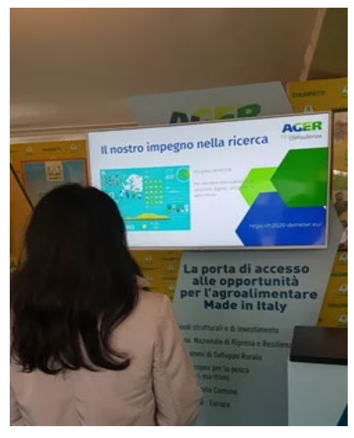
Figure 7: DEMETER promoted during the Villaggio Coldiretti.

this section, please give an overview of how you engage with the farmers on your pilot covering the following points. (Please use full sentences and paragraphs, not bullet points).