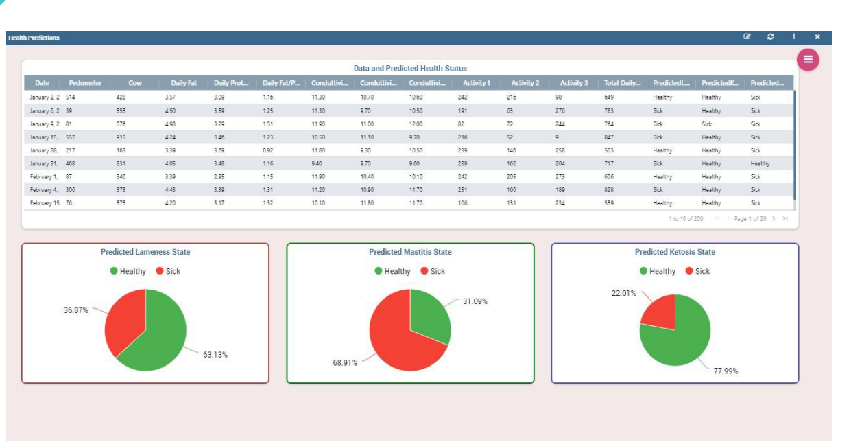
Figure 4: Pilot 4.2 - Animal Welfare Dashboard

The DSS on Milk Quality Prediction, within the milk processing chain, allows to evaluate the analysis of raw and processed milk samples coming from dairy farm, to determine the quality level of the milk, thus identifying the goodness both of the milk arriving at the processing company and of the processed milk ready for packaging, in order to understand if and what choice to make in order to improve its quality. The analysis of the milk samples taken into consideration by the DSS concerns 2 events: samples collected on arrival of the tanker, before unloading, and samples collected before packaging. The samples are processed by Pilot machinery, a device which analyses them using FTIR (Fourier Transform InfraRed Transform) spectroscopy.